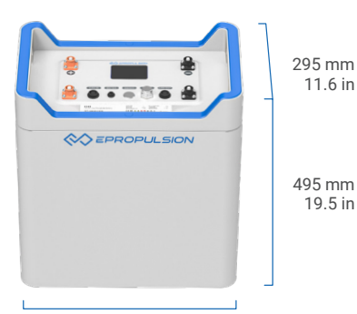
470 mm / 18.5 in